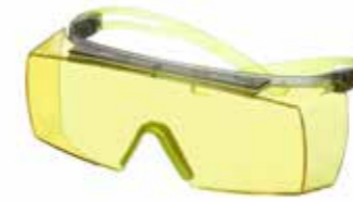
SF3703SGAF-GRN Linse: Gul Stel: Grå/limegrøn