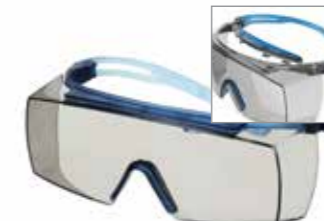
SF3707XSGAF-BLU Linse: I/O grå Stel: Grå/blå