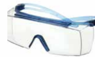
SF3701SGAF-BLU Linse: Klar Stel: Blå/blå