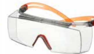
SF3701SGAF-ORG Linse: Klar Stel: Grå/orange