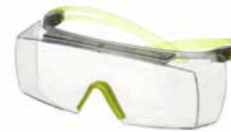
SF3701SGAF-GRN Linse: Klar Stel: Grå/limegrøn