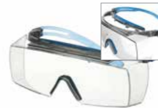
SF3701XSGAF-BLU Linse: Klar Stel: Grå/blå