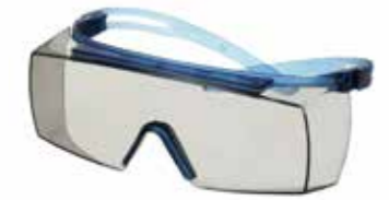
SF3707SGAF-BLU Linse: I/O grå Stel: Blå/blå