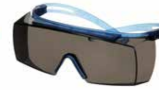
SF3702SGAF-BLU Linse: Grå Stel: Blå/blå