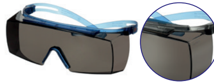
SF3702XSGAF-BLU (with brow guard)