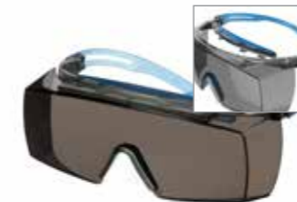
SF3702XSGAF-BLU Linse: Grå Stel: Grå/blå