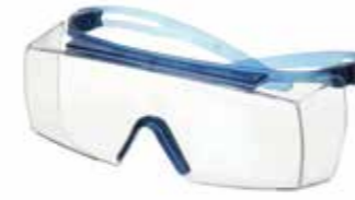
SF3701ASP-BLU Linse: Klar Stel: Blå/blå